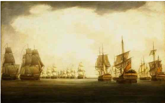
Admiral Sir Robert Calder's Action off Cape Finisterre by William Anderson