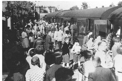
The first train, 15 January 1873 and the last train 18 June 1962