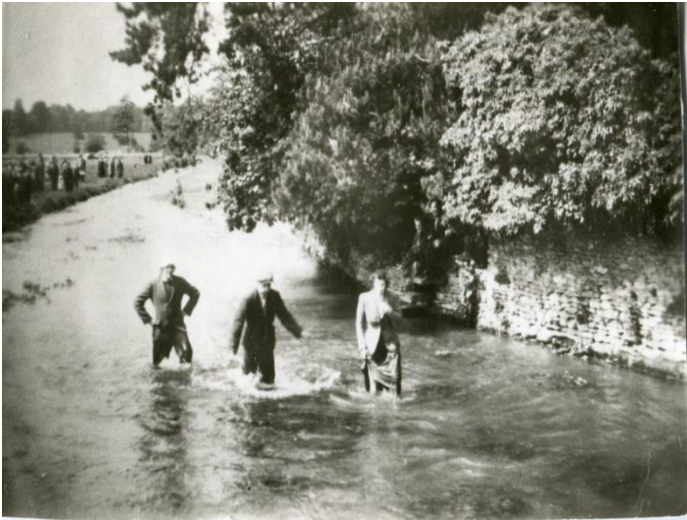
1953 River Race downstream