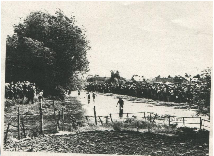
1977 River Race upstream