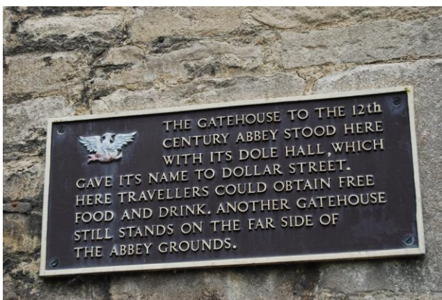
hence Dollar Street

Thanks to Cirencester Civic Society for giving us the opportunity to see parts of Cirencester that we had never noticed or known much about and we hope that they enjoy their return visit in July.